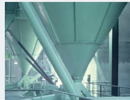
Mechanical Air Separator